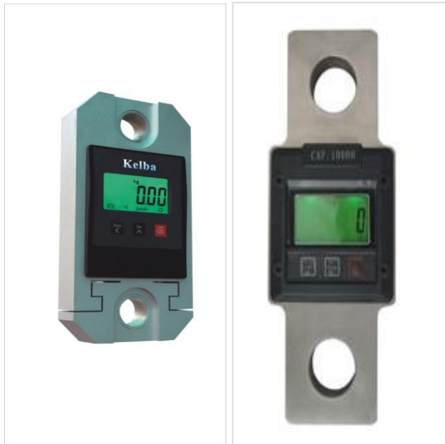
500kg – 5t